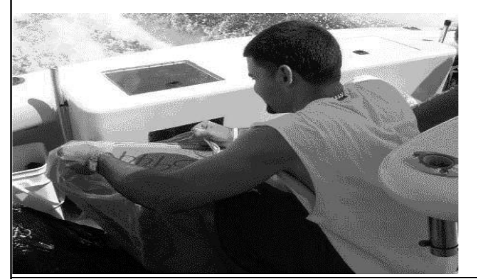
1. Remove protective plastic wrap