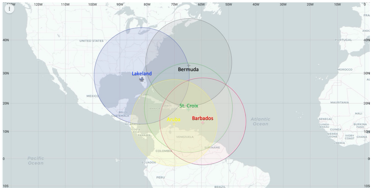
Figure D-1. Primary Atlantic operating bases and ranges (assuming ~2-h on-station time) for the P-3