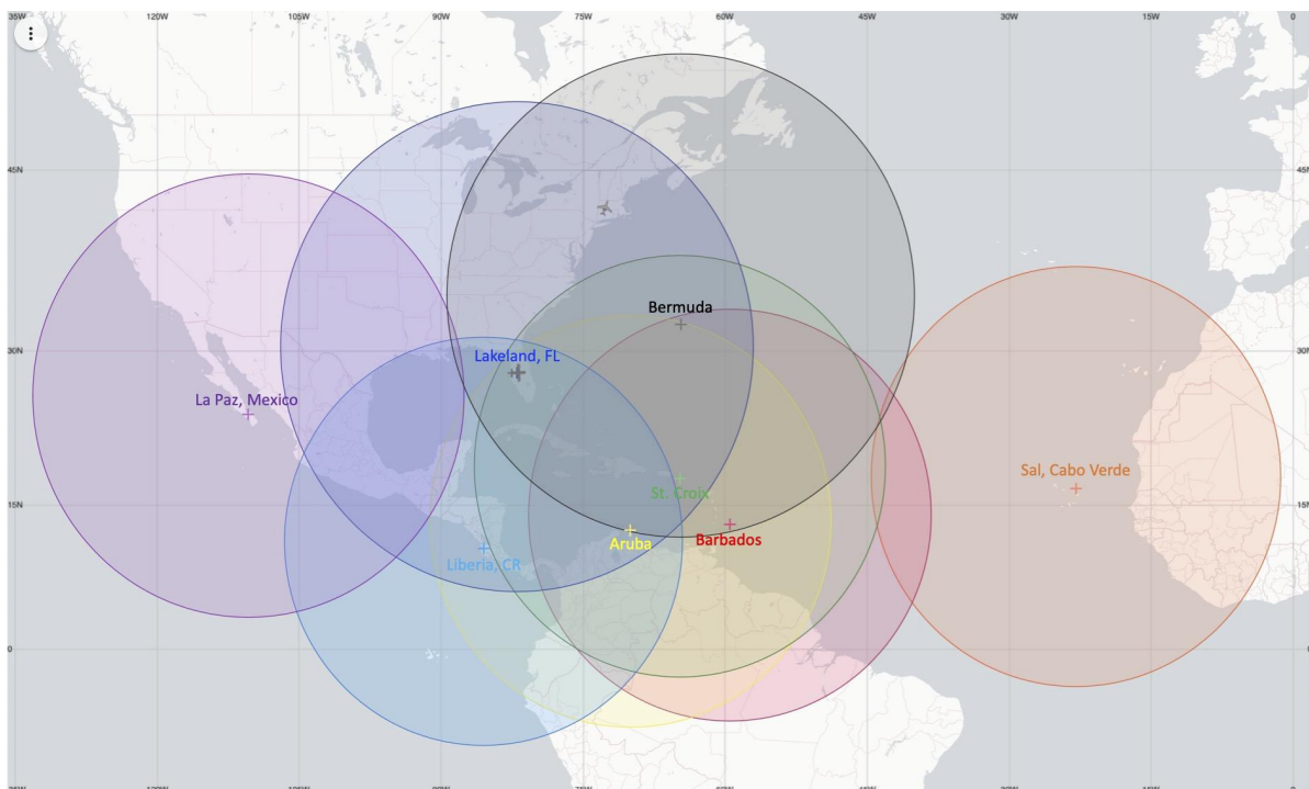
Figure D-2. Primary Atlantic and eastern North Pacific operating bases and ranges for the NOAA G-IV (~2-h on-station time).